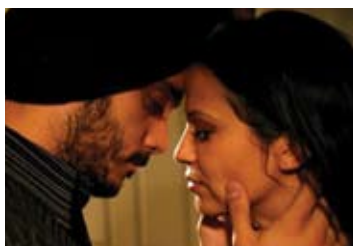
OCEAN OF PEARLS

Lord Ganesh sounds like a SOPRANOS mobster when east meets west in the Raj household in New Jersey. Call centers, Hindu hip-hop, dollar-store moguls and busybody aunts are all toppings for this extra-large slice of the immigrant story. The moral? Don't hang up on that call center operator. It might be your karma calling. WORLD PREMIERE