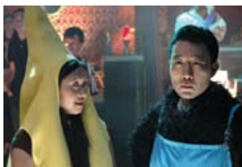
WHITE ON RICE