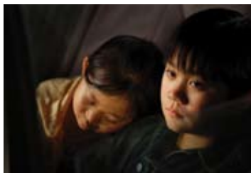
CHILDREN OF INVENTION

SAT 3.14 | 7:00PM | KABUKI | INVE14 TUE 3.17 | 7:00PM | KABUKI | INVE17 SAT 3.21 | 4:30PM | CAMERA | INVE21