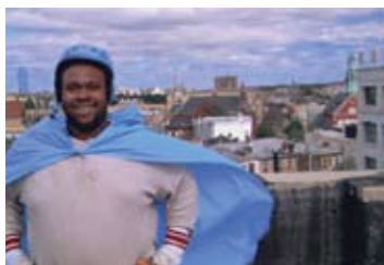
THE SPEED OF LIFE

A young Sikh doctor is forced to decide between his culture and career in this heartfelt dissection of the post-9/11 Sikh experience in North America. Winner of both the Grand Jury Prize and the Audience Award at the Los Angeles Asian Pacific Film Festival.